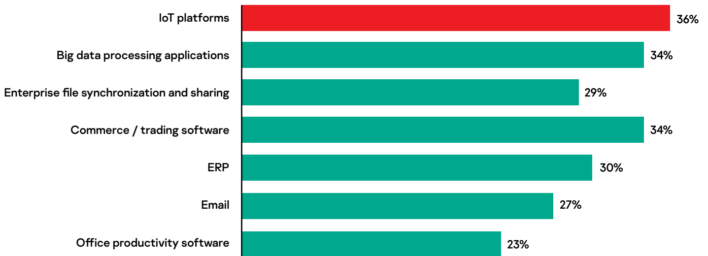
Table 2: what business applications are accessed by third parties, Kaspersky Global Corporate IT Security Risks Survey 2019

Among the attack vectors researchers found a remarkable instance of one conducted through a contractor that supplies building automation systems to different organizations. An attack to this contractor with backdoors and spyware would allow threat actors to gain remote access to facilities where these systems are being used, such as smart building systems in airports, transportation hubs or office buildings.